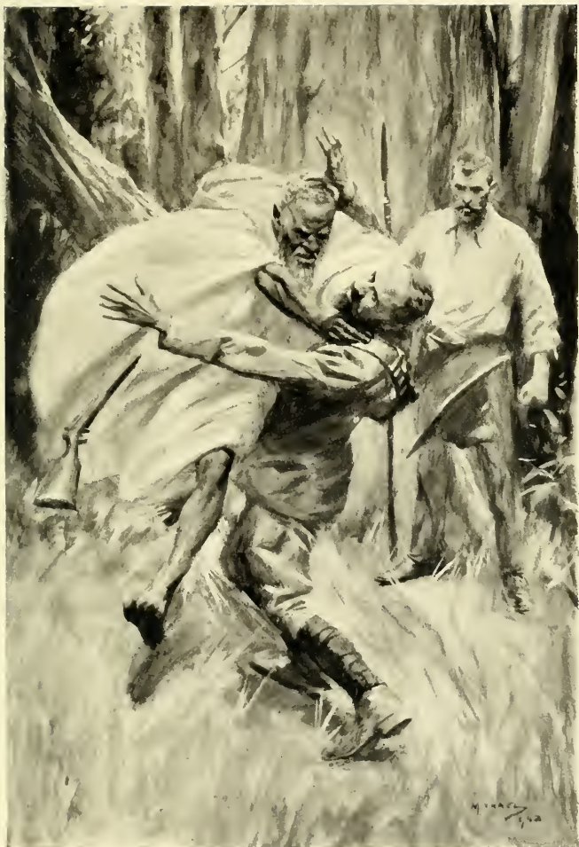
“With a spring like that of a tiger Jeekie was on Aylward” (page 317).